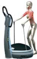
(4) Front Dumbbell Shoulder Raise