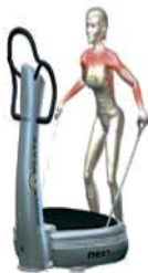
(5) Lateral Dumbbell Shoulder Raise

The study design was a pretest-posttest control group design. Each group was administered a pre-test of how many push-