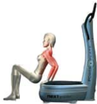
(3) Triceps Dip Off a Bench